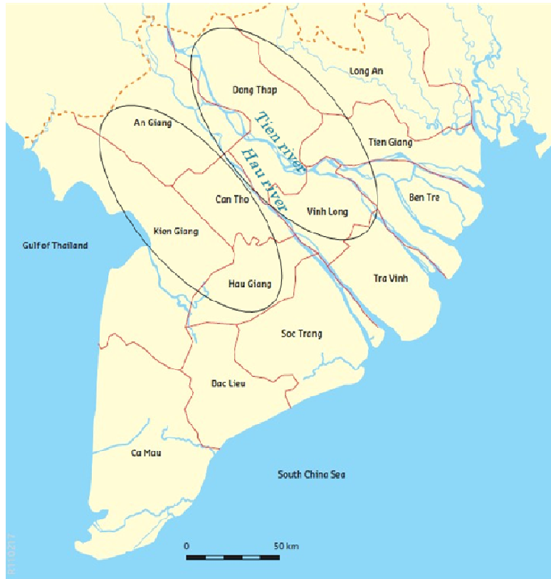
Fig. 1. Sub-regions in the Mekong Delta, Vietnam [23].

The data used for the calculation of annually generated rice straw are based on the average value of rice production over five years (2004–2008) obtained from the Statistical Yearbook of Vietnam 2008. Rice production in the Delta has increased in recent years, but will be reduced because of an urbanization rate of 2.5% per year and thus, the reduction of agricultural land [17].